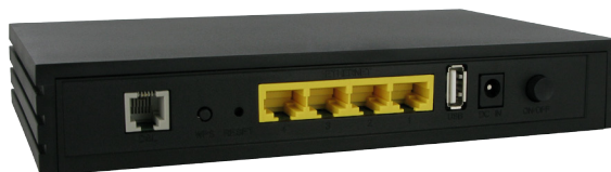
Technicolor TG581n back panel

Technicolor Professional Services are available to address your demands for qualified technical support & warranty, product maintenance, access to training courses and tailor-made solutions to specific product evolution. For more information, please ask your usual contact person.